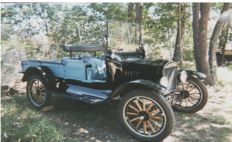
Jim's truck when he first got it way back.