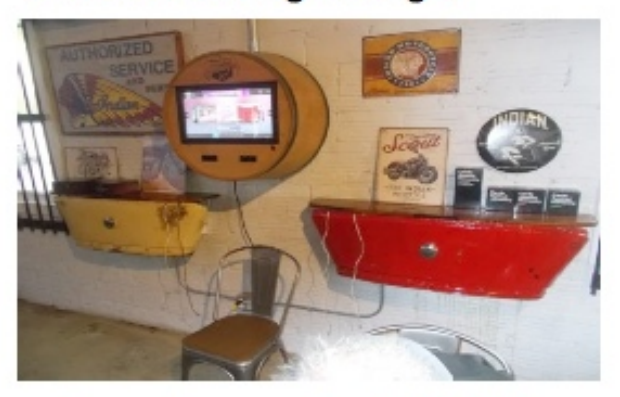
Gas tank on wall, with shelf made out of old wood and other stuff