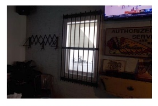
This is dark but you can see the rack hanging on wall, the print on the window with the sun shining, and the gas Tank and good stuff