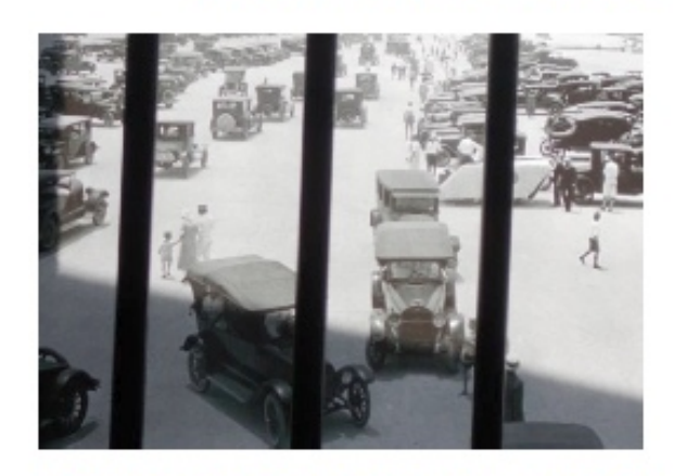
This is an old print on the window with sun shining through