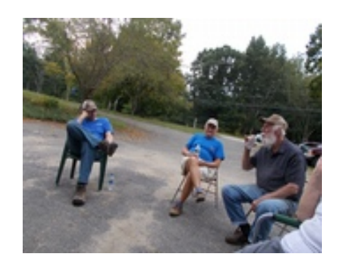
Looking for something?

Here is an auction with some old cars. At the end there is a steam roller https://www.youtube.com/watch?v=vNjJ_NsYr24