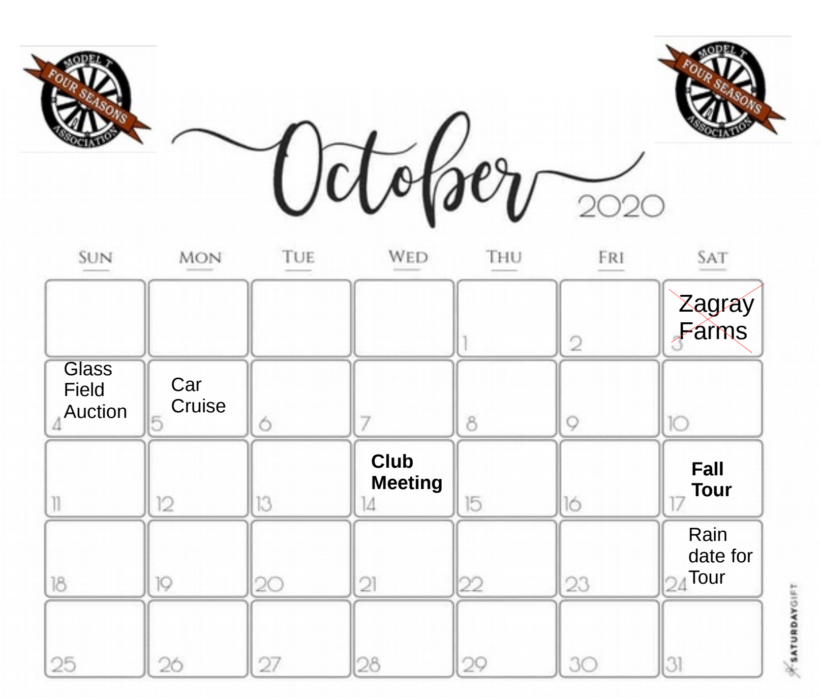
Oct.,3, Zagray Farms-- Cancel