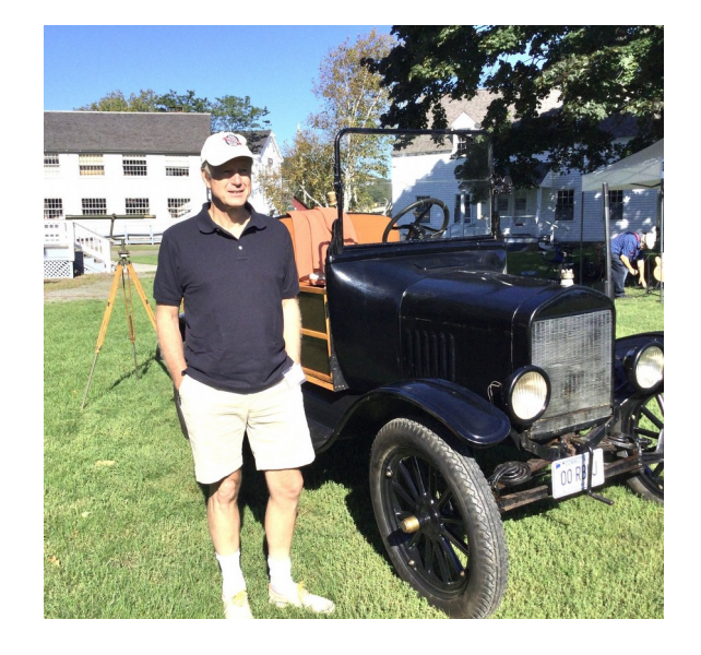
Time to get the long paints on!